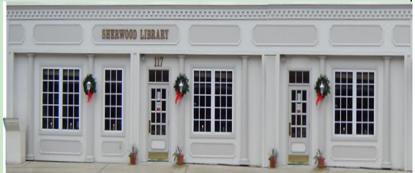
Proposed New Library Facade with Addition to Right